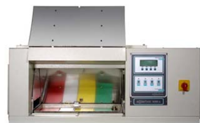
Solarbox Table top xenon testers 4 Models

We reserve the right to make changes to equipment and systems in response to advances in technology and modify parameter values accordingly.