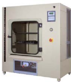
Vertical and Horizontal Salt spray chambers, 8 Models Full range of options for continuous and cycling test.