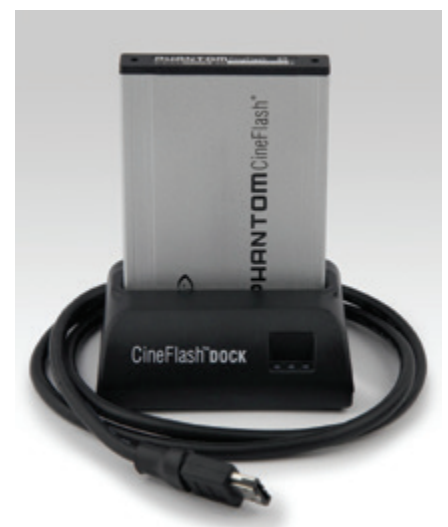
Phantom CineFlash Drive & CineFlash Dock