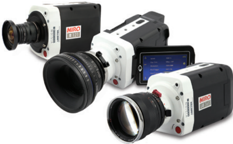
Phantom Miro LAB-, LC- and R-Series Cameras

Setup, capture, view, save, analyze. Powerful, high-speed imaging in the package of your choice.