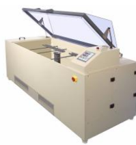
Corrosionbox H 1000 I