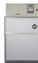
Solarbox 3000 RH

We reserve the right to make changes to equipment and systems in response to advances in technology and modify parameter values accordingly.