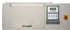
Solarbox 3000 e