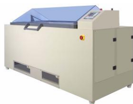
Corrosionbox H 600 I